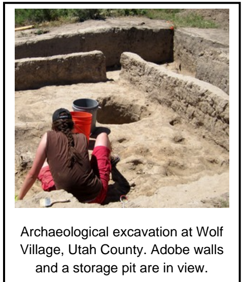
Archaeological excavation at Wolf Village, Utah County. Adobe walls and a storage pit are in view.

The field school students spend ten hours a day, five days a week learning how to conduct archaeological excavation, mapping, note taking, photography, and other skills. They have also called on the expertise of soil scientist to try and find